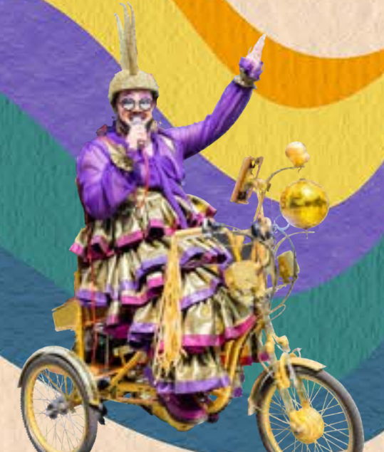
Big Gay Disco Bike