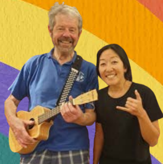
Skipton Ukulele Club